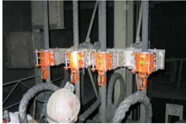
Fig.4. Rope inspection system INTROS to inspect four mining ropes at once

We have recently started two new projects at potassium mine in Russia to inspect hoisting ropes periodically with automatic data interpretation, and another one is to continuously inspect crane rope at steel mill. The rope at steel mill is subject of essential heating and needs continuous monitoring in order to prevent its break.