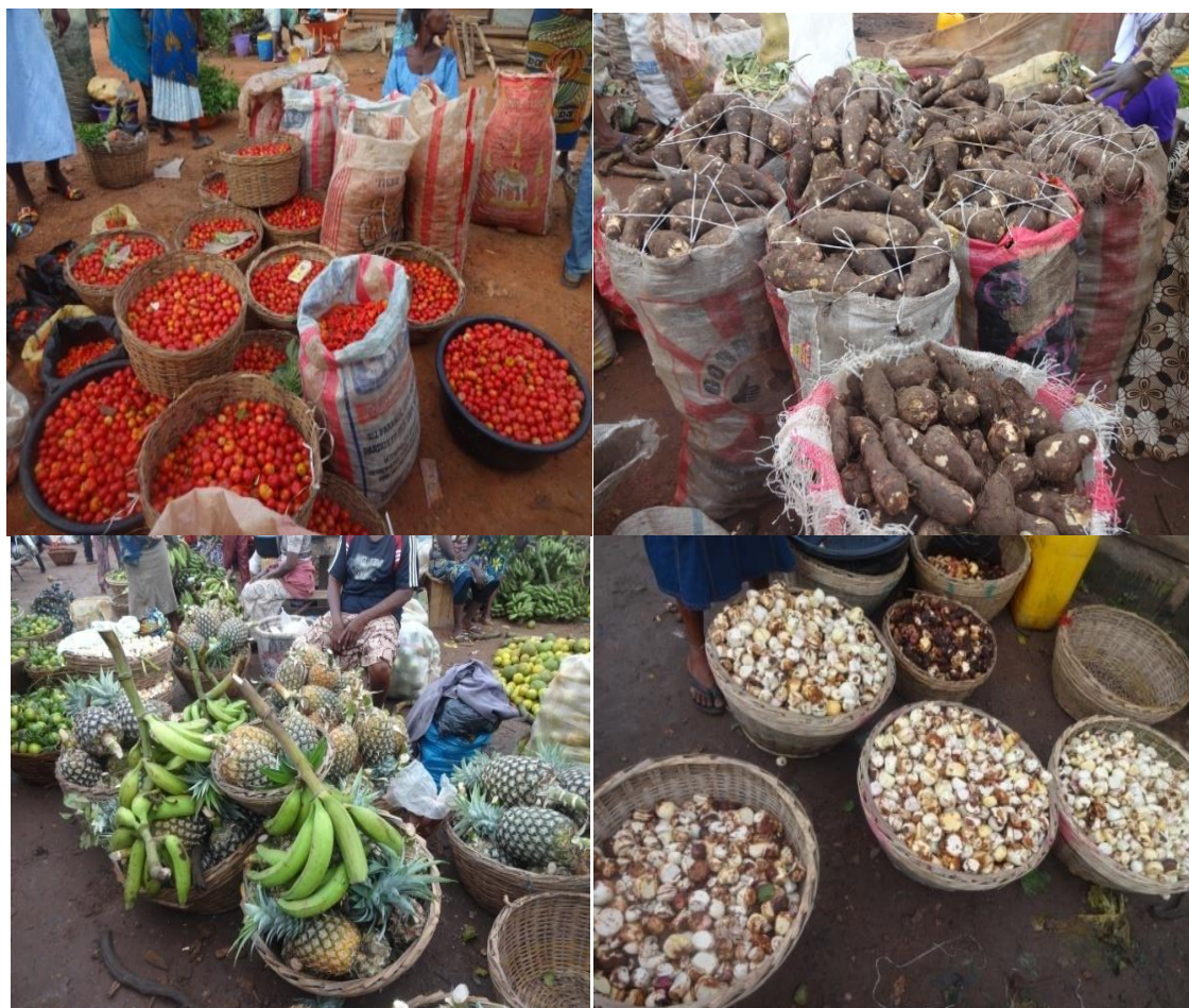
Fig 3 Type of packaging used for Agricultural Produce in Study Area