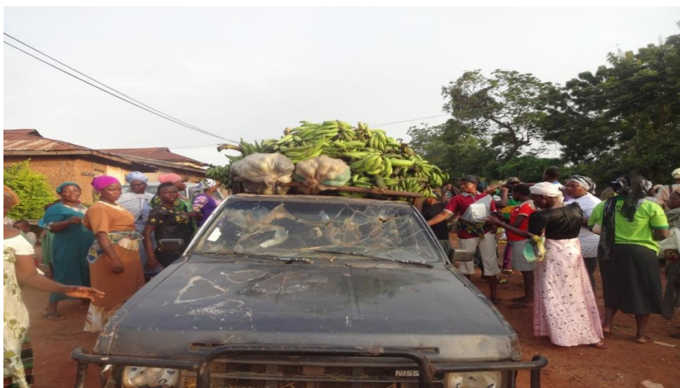
Fig. 2 Pick-up van for Transporting Agricultural Produce in the Study Area.