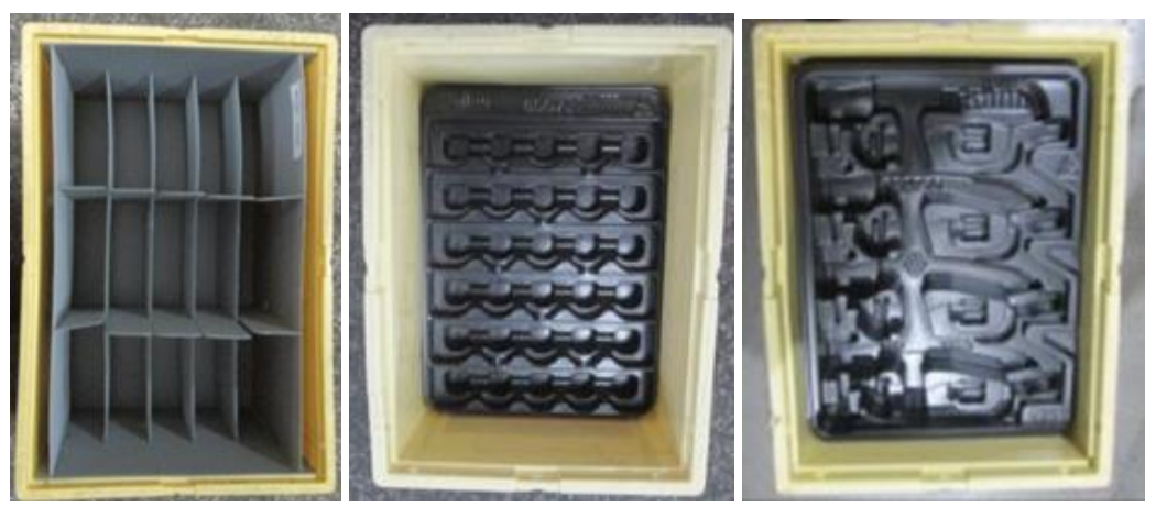
Fig. 2 Example of packaging with trays

After a visual inspection of the boxes and possible replacement, the boxes are prepared on the so-called rollers and subsequently they are placed in the zones determined for such box. Boxes placed in a respective zone are ready to be supplied on production line, the linefeeder brings them to the production line. Each production line is specific in terms of a type of the box. In other words, if the production line has a defined box of a certain type, the box of any other type cannot be used as the production line firstly weights the box, and it immediately refuses the box and displays error.