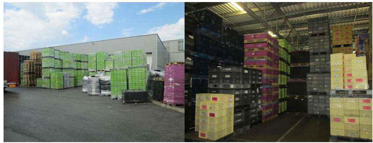
Fig. 4 Warehouse of returnable packaging