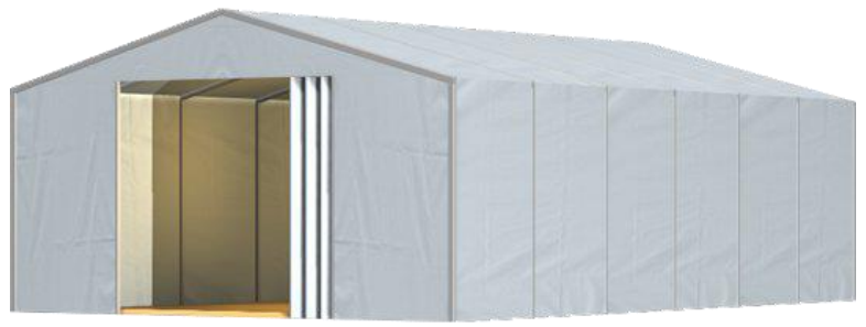
Fig. 5 Industrial storage tent

Another solution to increase the warehouse space is to purchase and build an industrial tent or a mobile hall (see figure 5 as an example). Tents can be effectively used as a temporary or long term solution. As the tent is covered, any heavy pollution of any stored goods inside can be avoided.